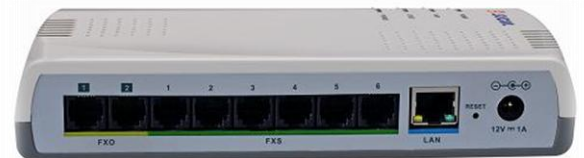
IP PBX Slican ITS