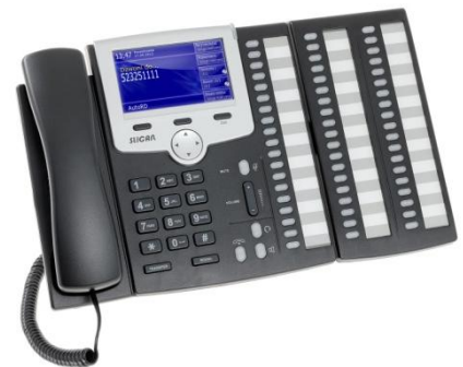
CTS-330 with CTS-338 console

Phone profile is created and stored in Slican PBX memory. Phone can be used immediately after switching it on, without complicated and time consuming configuration. Programmable BLF buttons allow you to create individual functions, services or create a list of handy contacts. For your comfort and to increase number of programmable keys, you may connect to each Slican CTS-330 system phone series up to 4 CTS-338 consoles. With consoles you may program up to 170 buttons.